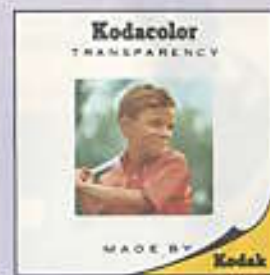
Color slides from color negatives