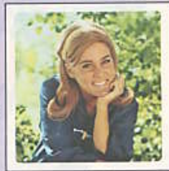
Color prints and enlargements from color slides