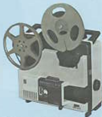
KODAK INSTAMATIC M105 Movie Projector. (Pictured with 400-foot reel in place.)

Two new projectors that offer you unusual projection versatility.