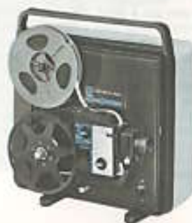
KODAK INSTAMATIC M65A Movie Projector