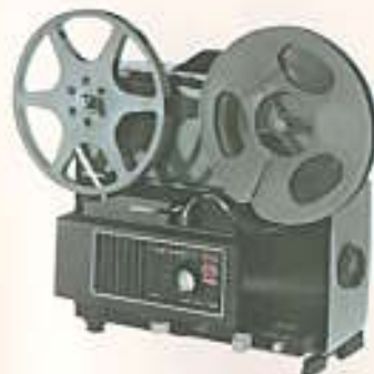
KODAK INSTAMATIC M68 Movie Projector