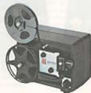
KODAK INSTAMATIC M50 Movie Projector

M70 Seven speeds, from slow to extra fast, give you all kinds of ways to add excitement, interest, and fun to every showing. "Stills," too. Very compact and so easy to use.