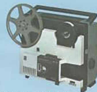
KODAK INSTAMATIC M109 Movie Projector. (Pictured with 50-foot cartridge in place.)

All are simple to operate, easy to carry, a breeze to store.