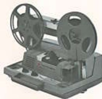
KODAK INSTAMATIC M95 Movie Projector